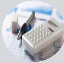
Accounting and tax services