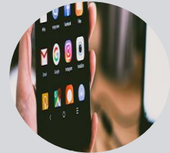
Mobile App development