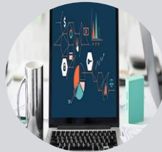
Wed design and development