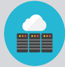
Web and email Hosting