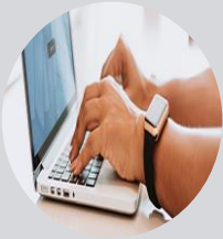
Digital and online Marketing